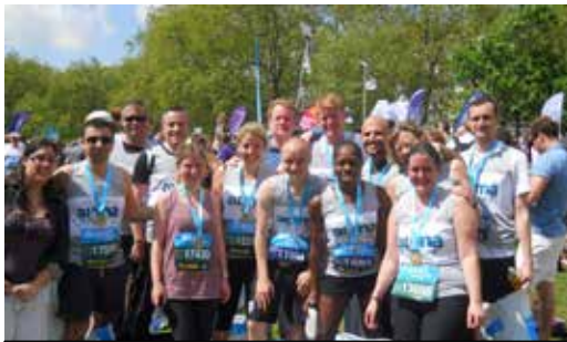
Bolt Burden Kemp BUPA 10K team raised over £1,000 for AvMA in beautiful May sunshine