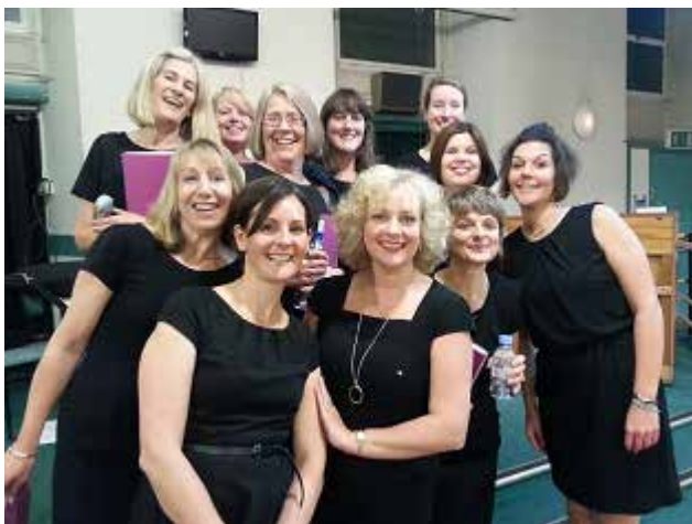
Joint Winners Shoosmiths Singers

Does your firm have a choir and do you enjoy singing with other choirs and an audience.