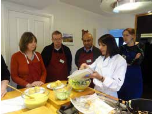
Learning curry cooking in Leeds 2015

AvMA Curry Nights are a great way to network and have a great evening out whilst raising funds for AvMA's patient safety work.