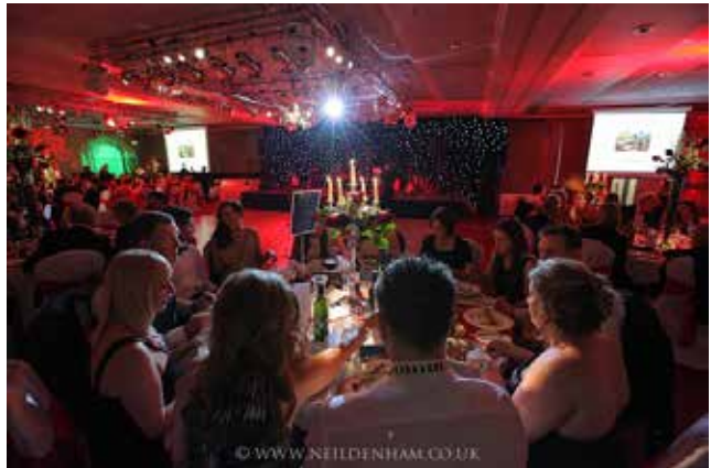
McKeag Rose Ball Dinner and Dance

McKeag & Co, Langleys, EAD, Field Fisher, A Neat Legal, McMillan Williams, St John's Chambers, Shoosmiths, Stephensons & Tees